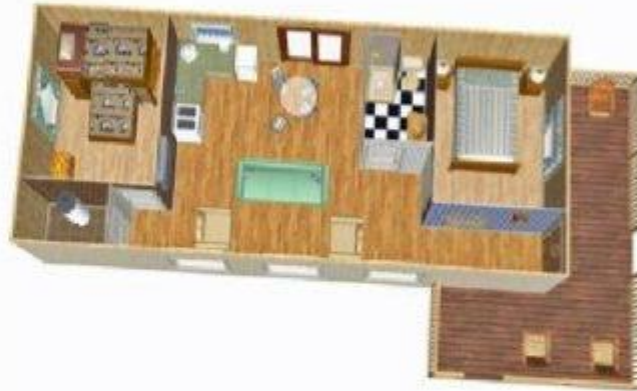
640 Sq. Ft. CABIN